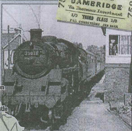
The Oxford to Cambridge Varsity Line

■ The completed 98-mile link between Edinburgh and Carlisle (closed 1969), of which the recently reopened Borders line forms part